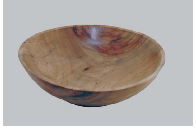
A very nice bowl turned from camphor by Roy Grant