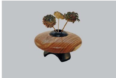
An interesting bud vase turned from china berry by Don Fournier