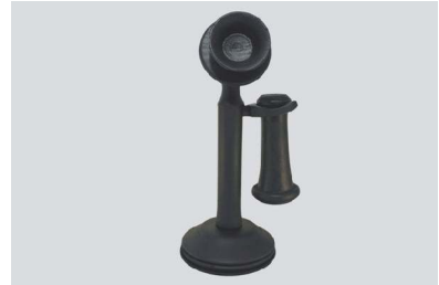
A "cordless phone turned by Don Fournier