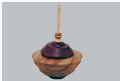
A very nice lidded vessel turned from camphor, aspen and wenge by Roy Grant